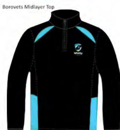
Mid Layer Top

We would like all children to have this top.